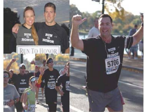
Run to Honor 2009 attracted nearly 100 USNA alumni, family and friends—the Chapter is looking for volunteers to help with RTH 2010

Note: You must register for the marathon or 10k separate from registering for the RTH.