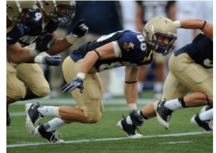
We're planning more away game viewing parties for the 2010 Navy football season